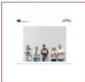
Experimental training materials (PDF)