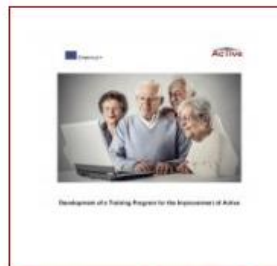
Training material (PDF)