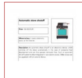
Automatic stove shutoff (PDF)

Every file on assistive technologies offers a description as well as links to a YouTube search with explanatory videos and/or further information like studies or Wikipedia pages on each technology. Clicking on these will open a new tab.